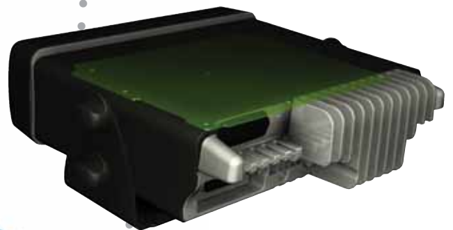
multiple D-range and serial ports