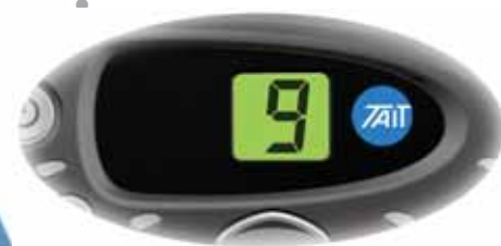
TM8110, with 1-digit display